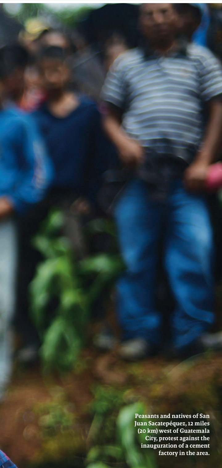
Peasants and natives of San Juan Sacatepéquez, 12 miles (20 km) west of Guatemala City, protest against the inauguration of a cement factory in the area.